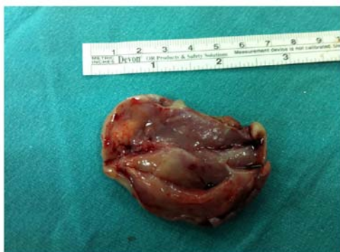
Figure 2. Gross appearance of the longitudinally incised fibrovascular polyp. The polyp core is composed of lobules of adipose tissue and bands of connective tissue.