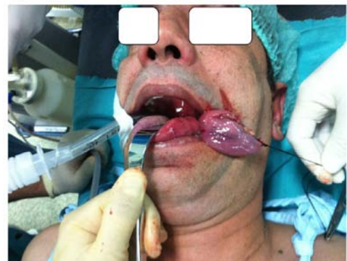
Figure 1. Pulling out the large pedunculated polyp measuring 7 \times 2 \times 1 cm.

A fibroid polypoid tissue which covered up with non-