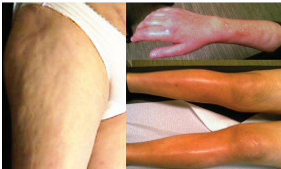
Figure 1. Orange peel skin on the thighs and cutaneous induration and erythema on the superior and inferior limbs.