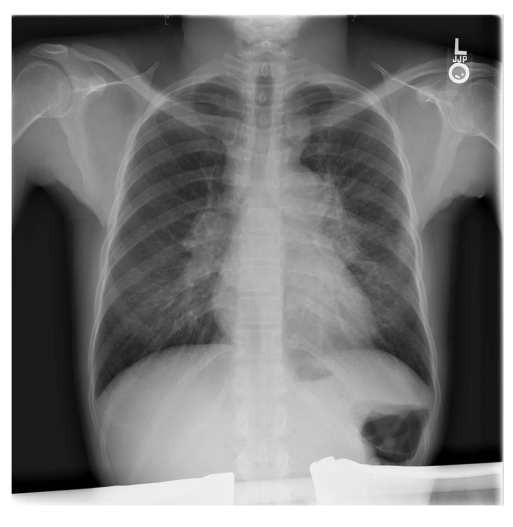
Figure 1. Chest radiograph illustrating mediastinal and bilateral hilar adenopathy.

The patient was in no acute distress with stable vital