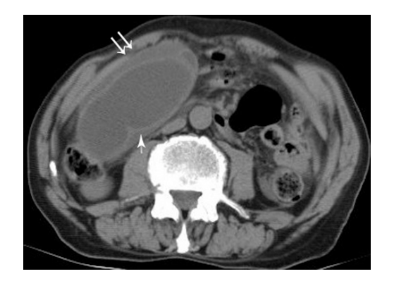
Figure 2. Abdomen CT; a hydropic gallbladder with a thickened wall (arrow) and pericholecystic free-fluid (double arrow).

tive Murphy's sign. Laboratory evaluations were within the normal range, other than leukocytosis (27,800 /mm<sup>3</sup>). Abdominal graphy examination was normal. Abdominal ultrasonography (USG) and computed tomography (CT) imaging revealed a hydropic gallbladder with a thickened wall (20 mm) and pericholecystic free-fluid, and its borders with the liver could not be defined clearly (Fig. 1, 2). Gallbladder perforation was considered as preliminary diagnosis. The decision to operate was made according to the physical examination, radiological findings, and presence of leukocytosis. Upon exploration of the abdomen, the gallbladder area was found to be severely inflamed with adhesions to surrounding tissues. The gallbladder was black in color, but there was no free bile in the abdomen. With continuing exploration, the gallbladder was found to have torsion of 180° along the axis of the cystic duct and artery. Necrosis had developed due to torsion, but no perforation was present (Fig. 3). The patient underwent a cholecystectomy with an uneventful postoperative course and was discharged on the second postoperative day. The patient was fine on the third month of follow-up.