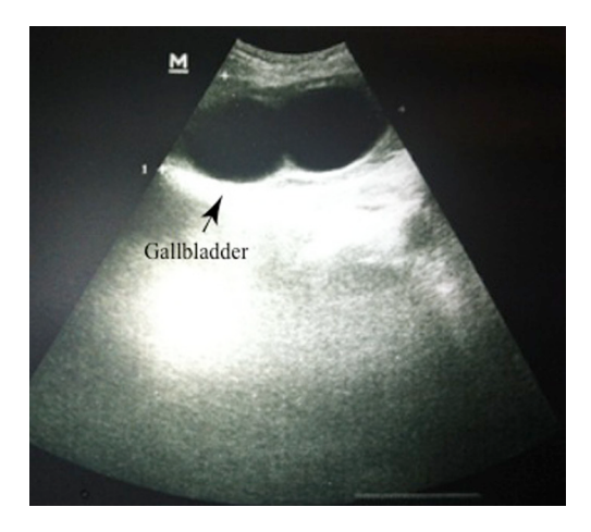
Figure 1. Abdomen USG; hydropic and lobulated gallbladder (arrow).

A 74-year-old male patient admitted to the emergency department with progressively increasing abdominal pain of two days' duration. His past medical history revealed a surgical operation for cancer of the larynx 18 years prior. Hemodynamic parameters of the patient with a tracheostomy were stable at admission (Blood pressure: 130/90 mmHg, pulse rate: 84 /min). He had no fever. Upon physical examination, diffuse tenderness and guarding in the abdomen, which was more marked in the right upper quadrant, was present with a palpable gallbladder in the right upper quadrant and a posi-