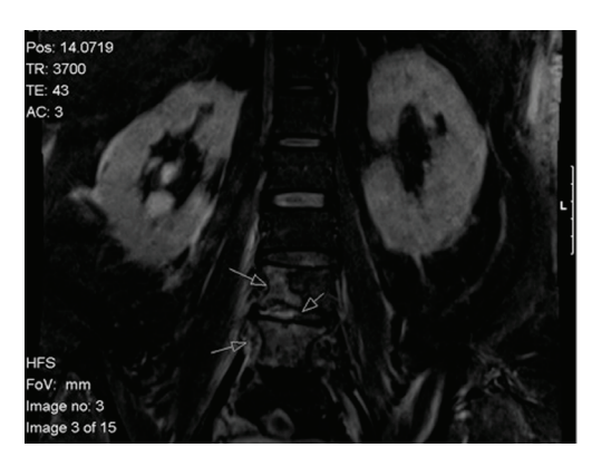
Figure 1. MRI T2 coronal view of lumbar spine: abnormal T2 hyperintensity and faint enhancement of L4-L5 intervertebral disc, with bone marrow edema seen within L4-L5 contiguous endplates and 3 mm anterior epidural fluid collection posterior to L4-5 intervertebral disc. The findings are consistent with L4-L5 infectious spondylodiscitis.