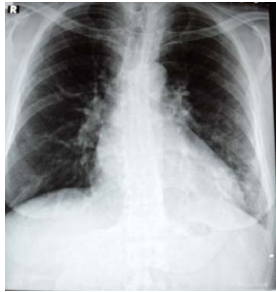
Figure 2. Chest X-ray 7 days later.

Definitive diagnosis of H1N1 was confirmed after discharged from hospital by nasal swab result which was done by Refik Saydam National Public Health Agency, Virology reference and research laboratory, national influenza center. Influenza A (H1N1)v PCR was performed with Qiagen artus