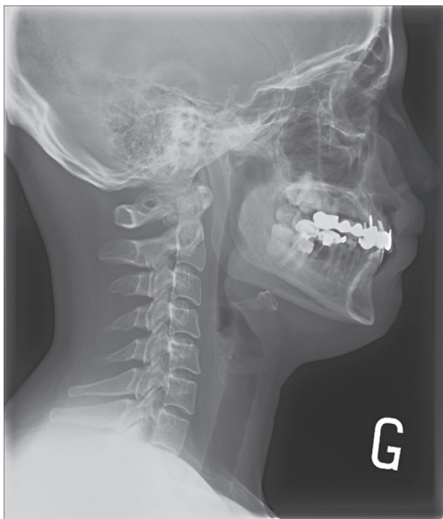
Figure 1. Soft tissue X-ray of the neck showing thickening of the prevertebral soft tissue, up to 8.2 mm at the level of the atlas.

were calcifications at the insertion site of the longus colli muscle in front of C1 (Fig. 2). Based on the clinical presentation and the pathognomonic findings on the CT-scan, a diagnosis of acute calcific tendinitis of the longus colli was made. The patient was treated with one dose of dexamethasone and diphenhydramine followed by a 2-week course of anti-inflammatories. She was released from the hospital on her second day, having improved with the dexamethasone. The patient brought the tick she had removed for analysis and it was confirmed to be an Ixodes scapularis . The PCR of the tick was negative for Borrelia burgdorferi and Anaplasma phagocytophilum .