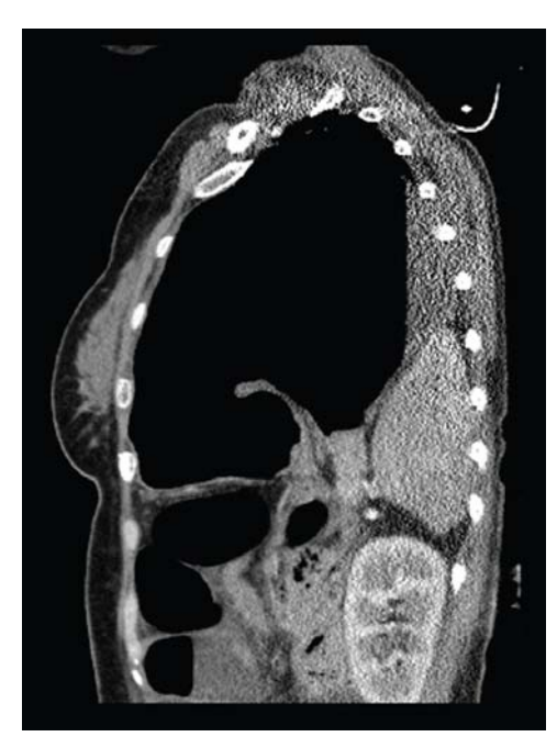
Figure 2. Spleen tissue in the thorax.

on the postoperative 12th day without any problems.