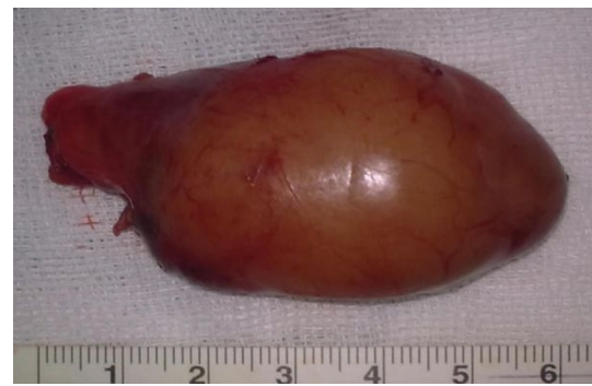
Figure 4. Left inferior parathyroid gland of the patient.

Although PTH secretion is modulated by serum calcium level, many studies have established a direct relationship between gland weight and serum PTH and calcium levels. Similarly, it has been found that an increased glandular mass correlates with the severity of PHPT and the subsequent risk of transient postoperative hypocalcemia [6]. Our patient had bilateral giant adenoma and significant preoperative hypercalcemia (19.24 mg/dL), but postoperative calcium levels were within normal ranges.