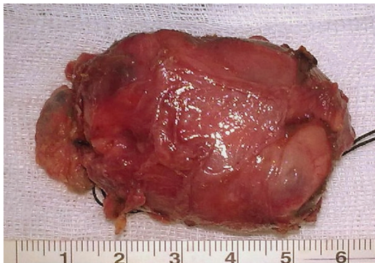
Figure 3. Right inferior parathyroid gland of the patient.

Patients with PHPT formerly presented with the classic pentad of symptoms (kidney stones, painful bones, abdominal groans, psychic moans and fatigue overtones). With the advent and widespread use of automated blood analyzers in early 1970s, there has been an alteration in the typical patient with PHPT, who is more likely to be minimally symptomatic or asymptomatic. Currently, most patients present with weakness, fatigue, hypertension, polydipsia, polyuria, nocturia, bone and joint pain, constipation, decreased appetite, nausea, heartburn, pruritus, depression and memory loss. Furthermore, these symptoms and signs improve in most, but certainly not at all, patients after parathyroidectomy [1, 8]. In our patient chronic renal failure and osteoporosis were the main findings.