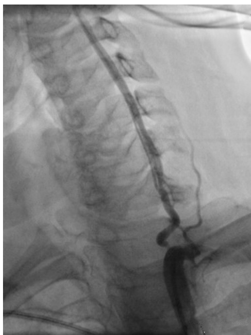
Figure 3. Digital subtraction angiography, high-grade VA atherosclerotic stenosis and VA dissection in V1 segment.

ischemic attack, sensorimotor cervical radiculopathy C5/C6, pulsatile tinnitus or occipital head and neck pain alone [8-10]. Arnold et al reported asymptomatic VA dissections in 8% of 169 patients with VA dissection [8]. It is interesting that in our case asymptomatic VA dissection developed in patient with asymptomatic atherosclerotic bilateral high-grade VA obstructions. The absolute risk of posterior circulation stroke in patients with atherosclerotic arterial disease and asymptomatic VA origin stenosis is low [11]. The absence of neurologic deficits in our case could be attributed to the developed collateral pathways during the slowly progressive atherosclerotic process and the adequate intracranial collateral flow.