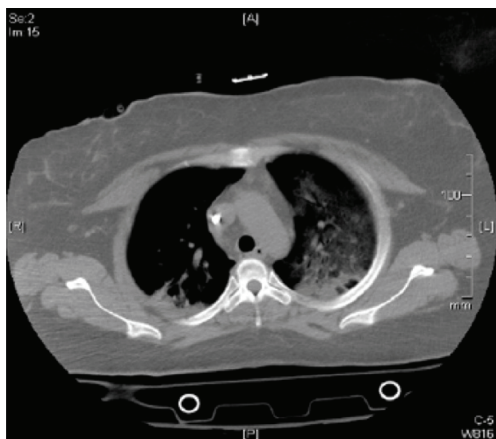
Figure 2. CT of chest on admission showing left-sided ground glass opacities.

for mildly decreased breath sounds on the left lung. There was no chest wall tenderness, appreciable murmur or peripheral edema. Labs showed a total leucocyte count 12,200/mm 3 , hemoglobin 12 gm%, platelets 276,000, sodium 138 mmol/L, potassium 4.8 mmol/L, glucose 121 mg/dL, BUN 48 mg/dL and creatinine 10 mg/dL. Chest radiograph (Fig. 1) showed stable mild cardiomegaly and left perihilar air space opacities with no pneumothorax or effusion. Computed tomography (CT) of chest (Fig. 2) showed diffuse ground glass opacities on the left side.