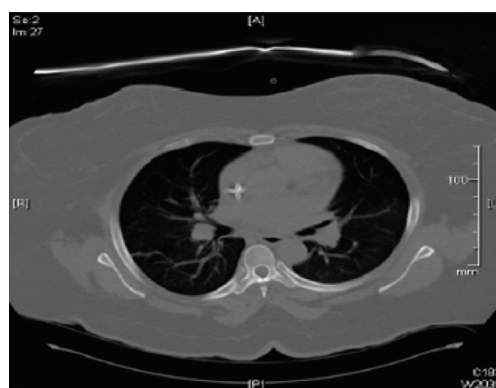
Figure 4. CT of chest on the next day showing resolution of the prior described left lung infiltrates.

underwent one hemodialysis session in our facility. On the next day, repeated chest X-ray (Fig. 3) and CT of chest (Fig. 4) showed resolution of the lung infiltrates and the patient was discharged home 1 day later.