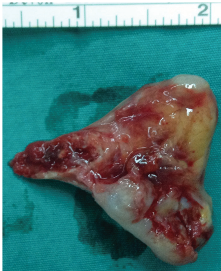
Figure 2. The material of total excision of osteochondroma.

was normal, but there was hypoesthesia on the hand dorsum. His past medical history was not remarkable. Soft tissue injury was initially doubted. Direct radiography showed a pedicle fracture of an osteochondroma on the one-third of the proximal metaphyseal-diaphyseal junction of humerus (Fig. 1). The operation was carried out under general anesthesia. The position of the patient was semi-supine. The approach was done on the right arm through an approximately 5 cm longitudinal midline posterior-laterally incision. Firstly the exposure was found between biceps and triceps inter-muscular septum, and then achieved the fracture of osteochondroma. It was seen that triceps muscle was injured by pedicle of osteochondroma. Total excision of the osteochondroma was performed without complication (Fig. 1, 2). The diagnosis of osteochondroma was confirmed after pathological examination of the removed part (Fig. 3). The postoperative period was quiet, and the patient has returned to his preoperative level of activity within 2 weeks. The radial nerve deficit was completely healed within 6 weeks.