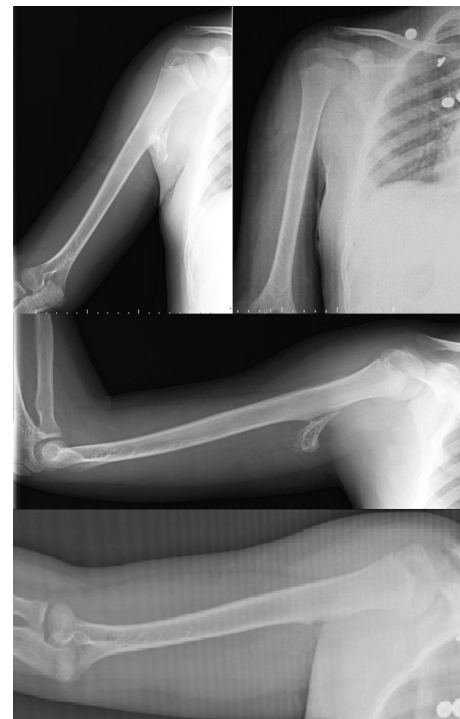
Figure 1. The preoperative and postoperative of radiography of patient.

A 13-year-old boy presented to the outpatient orthopedics clinic with pain in his right arm after the arm tourniquet inflated to measure blood pressure by orthopedic nurses. On physical examination, there was localized tenderness over proximally and posterior medially aspect of his arm with palpation. Joint of shoulder and elbow range of motion were normal. Vascular examination revealed no abnormality. There was radial nerve injury after the arm tourniquet inflated while motor function