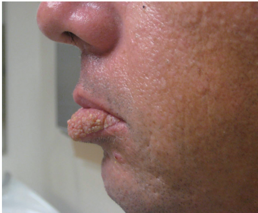
Figure 2. Profile of the patient's lesion.

However, within a few months the lesion fully recurred. The patient elected to undergo surgical treatment and is currently awaiting an excision and lip advancement procedure.