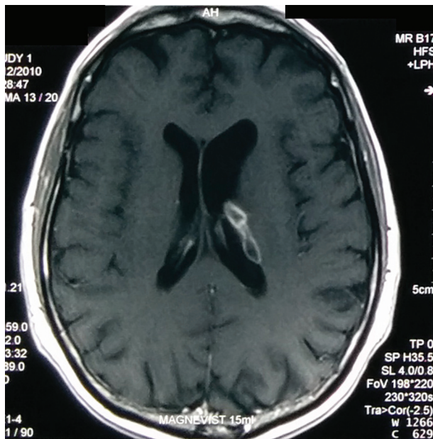
Figure 1. Gadolinium-enhanced MRI of the brain (during the patient's previous admission) had revealed a multilobular, peripheral-enhancing mass on the rim of the left lateral ventricle, consistent with a row of cerebral abscesses.

higher polymorphonuclear count, elevation of CSF protein and hypoglycorrhachia. On the basis of these findings, the treatment was changed to linezolid and meropenem. The patient became afebrile from the fourth day of linezolid's infusion. After 3 months, he was discharged home afebrile, without symptoms from the CNS, on linezolid. During the following 4 months, linezolid had to be discontinued for several weeks because of myelosuppression with subsequent relapses of the fever and headache. Because of the recurrence, the patient was admitted to our department.