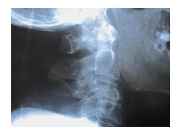
Figure 1. Plain radiographs of the cervical spine revealed only arthritic changes, consistent with the patient's age.

He was transferred to a tertiary spine center for further investigation. A CT scan of the cervical spine was performed,