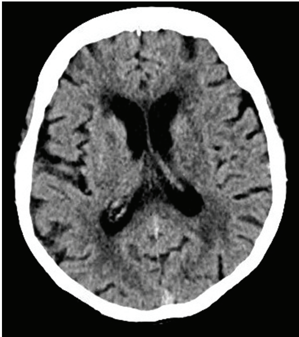
Figure 1. CT of head done 1 week before admission showing no hemorrhage.

were stable. Urine analysis showed too numerous WBCs. Patient was given 2 L of normal saline bolus and 1 g of rocephin intravenously. Patient's blood pressure improved significantly after fluid resuscitation. She was admitted in the hospital on the suspicion of possible sepsis secondary to UTI. Urine culture was again positive for enterococcus which was sensitive to penicillins. Blood and sputum cultures were negative for any bacteria. All baseline tests including CBC, CXR, EKG, serum electrolytes, renal and liver function were normal at the time of admission other than albumin level which was low (2.1 g/dL). PT/INR and PTT were also within normal limits. Patient was continued on rocephin and most of her home medications including baby aspirin. Patient was started on subcutane-