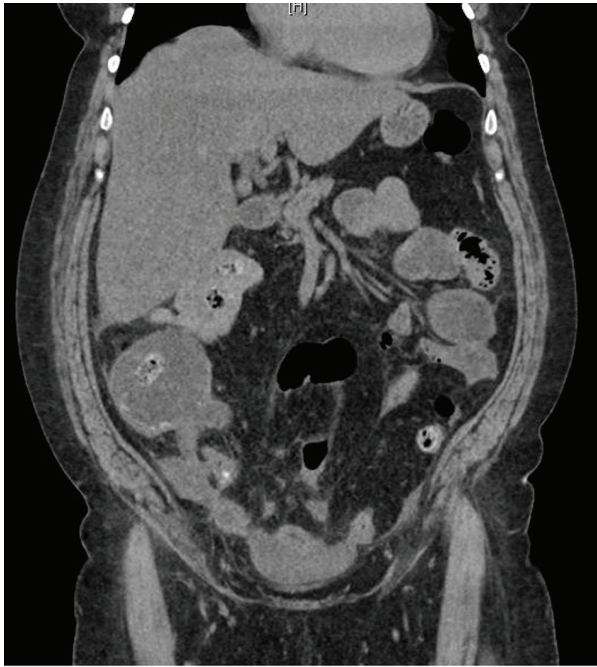
Figure 1. CT urogram demonstrating signs of appendicitis.