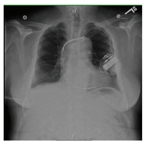
Figure 5. A flexible alligator cystoscope forcep was inserted through the port with successful recovery of the J-wire.

Over the last few decades, there has been an increase in the number of percutaneous cardiovascular interventions. Un-