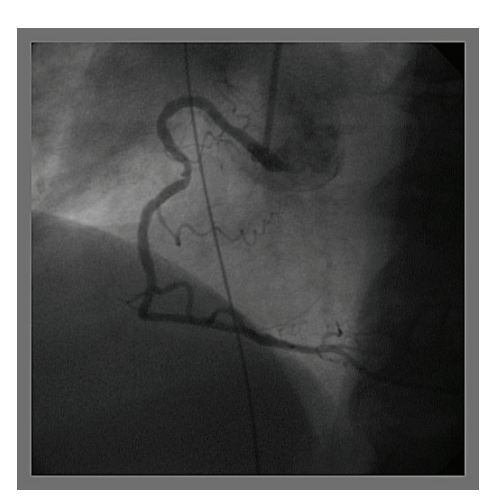
Figure 2. J-wire was seen spanning from the superior vena cava (SVC) to inferior vena cava (IVC) without looping in the right ventricle in 2007.

to IVC without looping in the right ventricle (Fig. 2). It was believed that the wire was left over from a right heart catheterization done at an outside institution at least seven years prior to his presentation. At that time, attempts to retrieve the wire using different percutaneous retrieval devices were unsuccessful. It was felt that the wire was endothelialized and/or layered with thrombus, so no further intervention was undertaken at that time. Given these presenting symptoms and migration of the J-wire cephelad, a repeat endovascular approach was attempted.