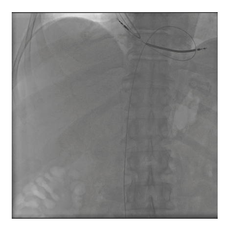
Figure 1. J-wire was noted to run from the superior vena cava (SVC) to the right atrium, looped through the right ventricle and into the inferior vena cava (IVC) under fluoroscopy.

To rule out coronary ischemia, cardiac catheterization was performed, which revealed stable coronary artery disease. Under fluoroscopy, a J-wire was noted to run from the superior vena cava (SVC) to the right atrium, looped through the right ventricle and into the inferior vena cava (IVC) (Fig. 1). The J-wire was also seen on a prior heart catheterization in 2007, but at that time was seen spanning from the SVC