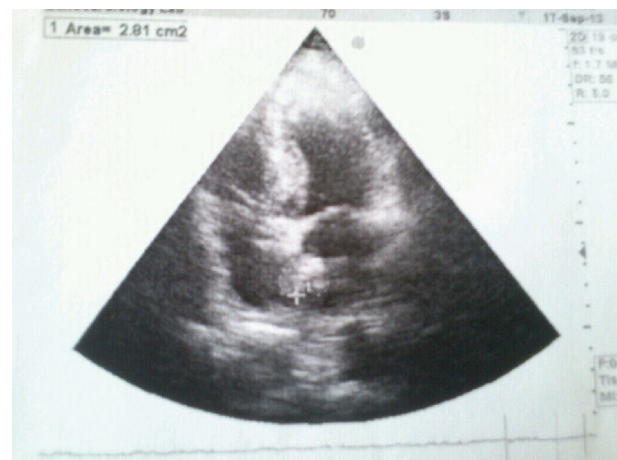
Figure 1. Heart ultrasound showing the left atrial mass attached to the interatrial septum.

The patient was placed under general anesthesia with endotracheal double-lumen intubation, at left lateral position. A right lateral thoracotomy without rib excision was performed. The right lung was deflated and the pericardium was opened. Bypass circulation with fibrillation and direct cannulation of