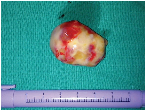
Figure 2. The mass completely excised.

the aorta and the inferior vena cava was initiated and blood cardioplegia was used. The left atrium was opened, revealing a pale mass (Fig. 2). The mass was attached to the interatrial septum. Complete excision of the mass was performed, including part of the interatrial septum (Fig. 3). A patch was used to secure the opening of the interatrial septum. Continuous prolene 3/0 suture was used to close the left atrium and the bypass was terminated, after the transesophageal echocardiogram confirmed the lack of air in the cardiac cavities. The postoperative course was uncomplicated and the patient was discharged from the hospital after 5 days. Pathology examination confirmed the diagnosis of a myxoma.