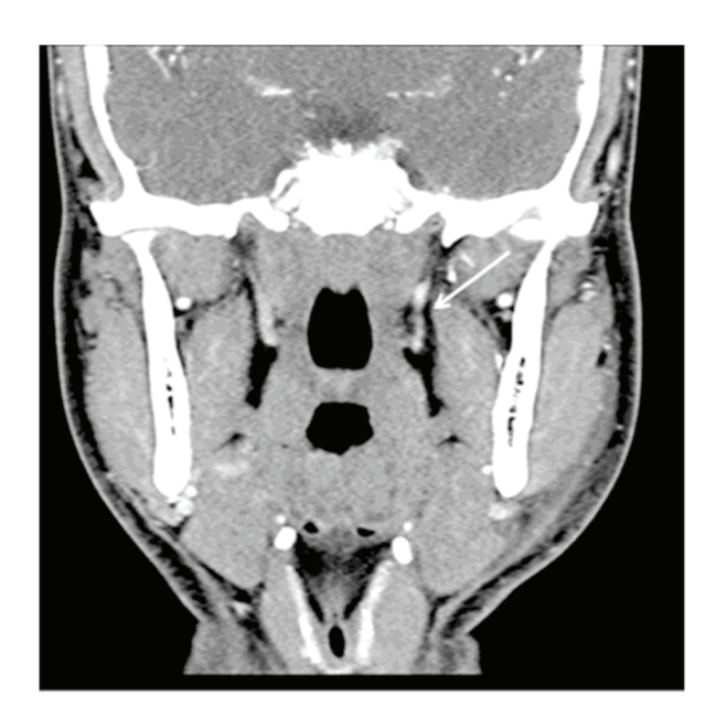
Figure 1. CT scan of the facial bones demonstrating a left facial/preseptal soft tissue swelling, with an associated thrombosis of a second-order branch of the left facial vein.

Sputum culture was negative. Anerobic culture from the left nares grew Propionibacterium acnes .