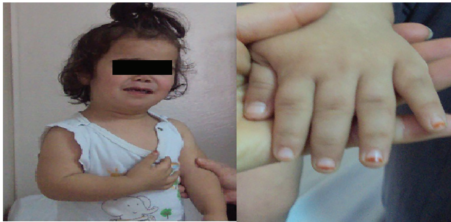
Figure 1. The view of the patient from the front and the view of the patient's hands.

reported [5, 6]. Our patient showed the major findings of this syndrome such as bilateral sensorineural hearing loss, mid-face hypoplasia with a flat nasal bridge, anteverted nostrils, and mesomelic shortening of upper and lower extremities. The radiographic changes also supported OSMED syndrome with the findings of shortening of humerus, radius, ulna femur, tibia, fibula and squared iliac wings. Short hands and fingers were other common findings of this syndrome that are also present in this patient [1].