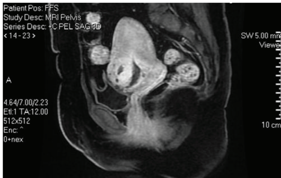
Figure 2. MRI showing 2.6 cm rounded, complex T2W hyperintense structure representing post dilation and curettage arteriovenous malformation.

Diagnosis of a uterine AVM should be based on pertinent patient history accompanied by negative beta hCG results and characteristic radiological findings. Angiography is the gold standard for the diagnosis of AVMs but it is rarely performed for diagnosis alone due to its invasive nature and is usually