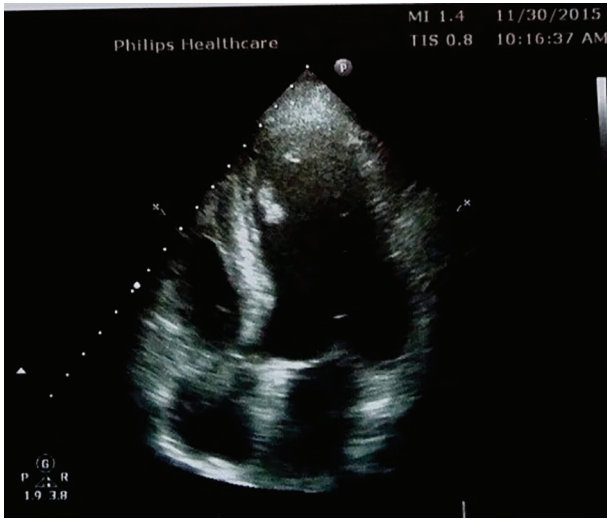
Figure 1. A protruding, well-contoured left ventricular thrombus on apical segment of the interventricular septum detected by echocardiography.

and a protruding, well-contoured, mobile thrombus, with a dimension of 12 × 7 mm located in the apical segment of the interventricular septum (Fig. 1). LV ejection fraction was estimated 54%.