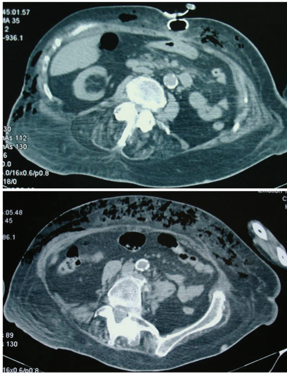
Figure 2. Abdominal CT revealing the bumper migration, subcutaneously, and presence of subcutaneous emphysema.

values showed 9,000,000/ \mu L white blood cells with 84% neutrophils, hemoglobin 8 g/dL, hematocrite 25.2%, urea 80 mg/dL, creatinine 1.58 mg/dL, K^+ 4 mmol/L, Na^+ 126 mmol/L and Ca^{2+} 7.90 mmol/dL.