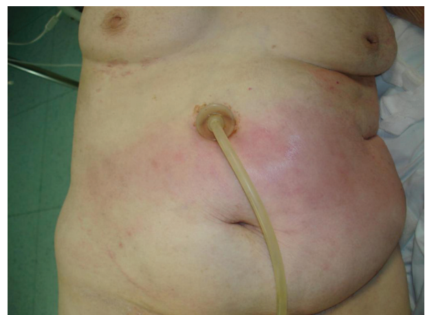
Figure 1. During admission, the whole anterior abdominal wall was seen reddish and inflamed.

The terminal stage of dementia made the patient unable to communicate, and her relatives did not report any change of behavior or other symptoms on her behalf. On clinical examination, crepitus was found in the major part of anterior abdominal wall which was reddish (Fig. 1). Complete laboratory