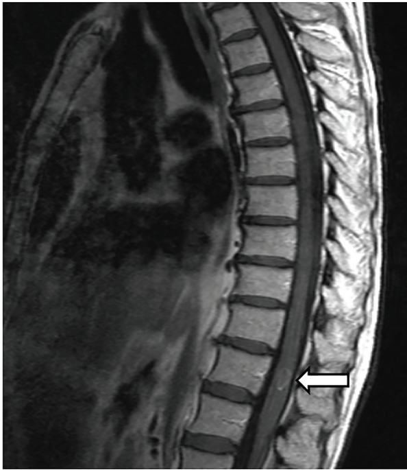
Figure 1. Sagittal view of magnetic resonance imaging with enhancement showing an intramedullary spinal cord lesion at D12 level (arrow).

lary cone to approximately D3 (Fig. 1). The features of this intramedullary expansive lesion were suggestive of metastatic lesion.