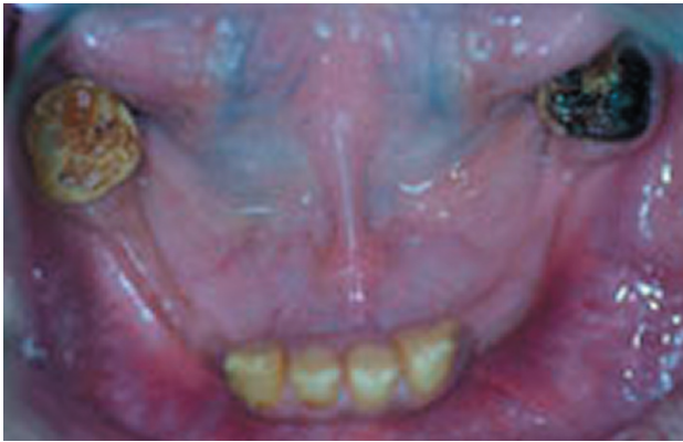
Figure 2. Partially edentulous mandible with remained carious teeth.

are seen rarely and are usually associated with systemic conditions. Guided eruption of many teeth with the help of coordinated multidisciplinary management is needed for patients with multiple impactions [6].