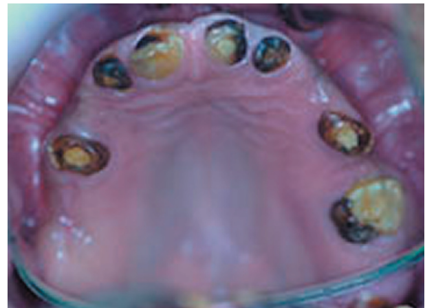
Figure 1. Partially edentulous maxilla with remained carious and rotated teeth and deep palatal vault.

Epidemiological studies have reported dental impactions to affect 25% to 50% of the population [5]. Multiple impactions