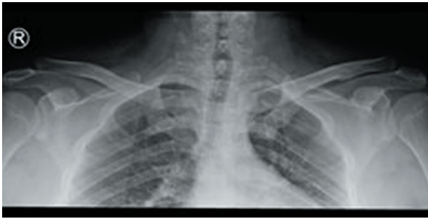
Figure 5. Chest X-ray did not reveal any other obvious deformities.

[11, 12]. Features of Yunis-Varon syndrome are agenesis or hypoplasia of clavicle, severe micrognathia, digital anomalies, hypodontia, spinal defects, and impacted teeth. Both the syndromes presented with multiple impacted teeth but were ruled out from our case as other symptoms were not present.