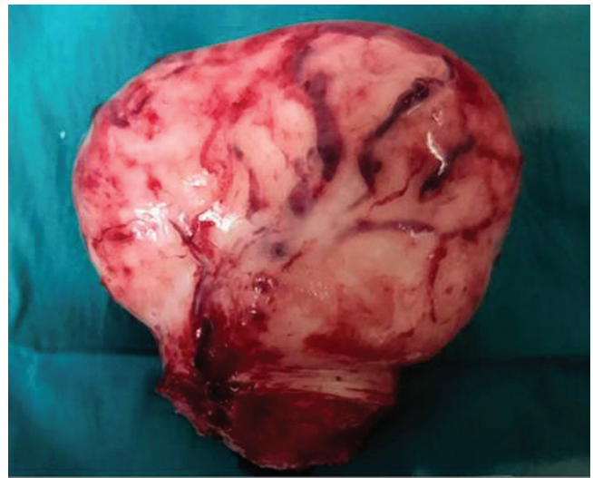
Figure 3. Specimen of the excised myoma.