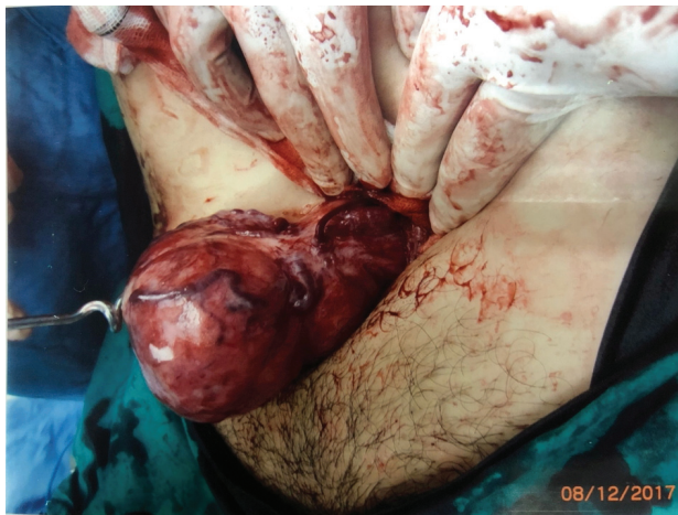
Figure 2. Active bleeding from the vein overlying a myoma.

which causes rupture of superficial veins [3]. Bleeding can also be arterial and usually associated with hypertension. Trauma causing avulsion of a fibroid, torsion of a pedunculated fibroid, and pregnancy causing venous congestion resulting in vessel rupture are other possible etiologies for intra-abdominal bleeding from a fibroid [4-6]. With regard to our case, we could not demonstrate any cause that could lead to rupture of the vessel.