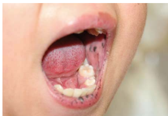
Figure 1. Pigmentation on the lips and the oral mucosa.