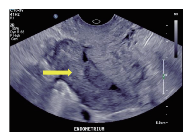
Figure 1. Transvaginal ultrasound scan of the pelvis showing an endometrial polyp (arrow) and absence of intra- and extrauterine pregnancy.

mass seen, resolution of hydronephrosis and no distant metastasis. The previously noted thrombosis in right uterine, internal iliac and common iliac veins had resolved. The patient was then planned for surveillance monitoring. She remained disease-free for 9 months.