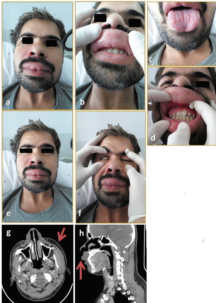
Figure 1. (a, b) Right side edema with swollen upper lip. (c, d) Fissured tongue, gingival hypertrophy. (e, f) Facial nerve examination; flattened right forehead, weakness in closing the right eye. (g, h) CT scan showing right side facial swelling and upper lip swelling.

relapsing facial edema, and fissured tongue) were reported for only 8-18% of cases, and so the diagnosis is commonly overlooked [5]. Such cases typically present with facial palsy as the first complaint, as it generally precedes the other two symptoms by a few years [2, 6-8]. Hence, the triad of symptoms that would indicate a diagnosis of MRS is not consistently present [9]. We suggest that the sequence of the symptoms' onset may be indicative of the underlying pathology.