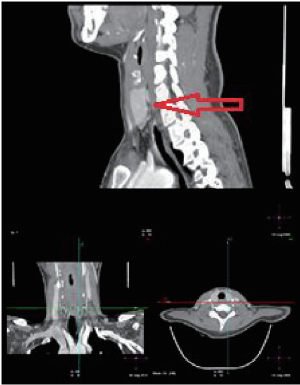
Figure 1. Computed tomography (CT) images of parathyroid adenoma (arrow).