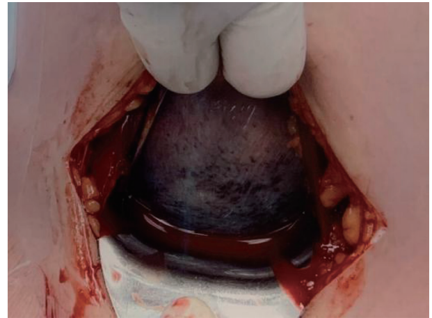
Figure 2. Intraoperative findings during laparotomy with dark purple patches of the uterus suggestive of Couvelaire uterus.

Couvelaire uterus is caused when hemorrhage from placental blood vessels seeps into decidua basalis causing placental separation, followed by infiltration in the lateral portions of the uterus [3]. However, this does not usually affect the uterine ability to contract and surgical decompression usually allows constriction of spiral arteries [2]. Placenta abruption is an ob-