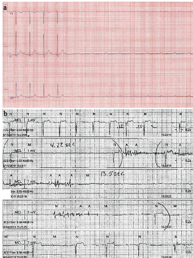
Figure 2. (a) ECG during DSE showing prolonging PR interval followed by complete heart block and ventricular asystole due to lack of escape rhythm. (b) Telemetry strip post-admission showing the same rhythm. ECG: electrocardiogram; DSE: dobutamine stress echocardiography.