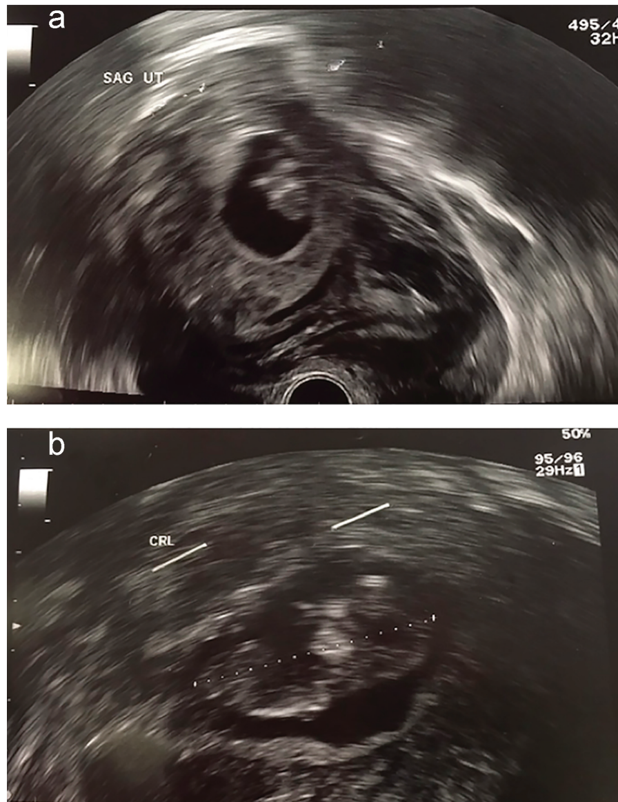
Figure 1. (a) Sagittal view of uterus. (b) Measurement of crown rump length (CRL).

lower abdominal pain for 1 day, with a positive urine pregnancy test. She had no past medical history, and surgical history comprised of one previous termination of pregnancy. She was unable to recall her last menstrual period but reported taking abortion pills 2 weeks ago. Physical examination revealed an enlarged uterus of 12 weeks size, with mild tenderness on palpation of the suprapubic region but no rebound or guarding. Speculum examination revealed a closed cervix with minimal vaginal bleeding.