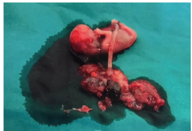
Figure 3. Fetus and placenta.

In terms of initial presentation, there appears little that could have raised our suspicion for an abdominal pregnancy. The patient did not have any risk factors for abdominal preg-