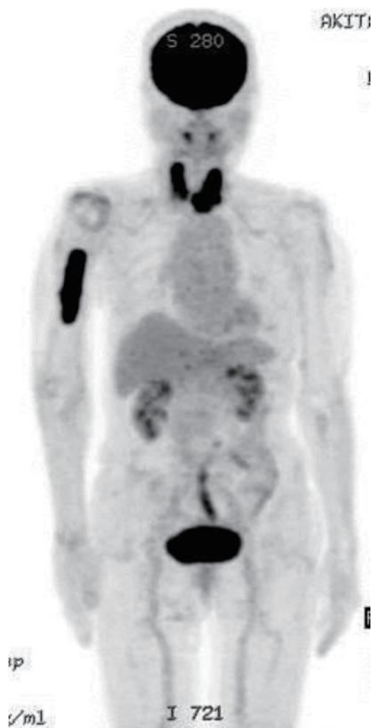
Figure 2. Positron emission tomography with ^{18}\text{F} -fluorodeoxyglucose (FDG-PET) demonstrated the high maximum standardized uptake value ( \text{SUV}_{\text{max}} ) in the right humerus and bilateral thyroid glands.

proximately 50% of GS cases are initially misdiagnosed, most frequently as lymphoma [4, 9], as well as small round cell tumors, undifferentiated carcinoma or melanoma, extramedullary localization CMPD, or other non-malignant lesions [10]. Immunohistochemical analysis is useful for preventing misdiagnosis. Audouin et al proposed that some variants of GS could be distinguished based on by immunohistochemical analysis of MPO, CD68/KP1/PGM1, lysozyme, CD34, factor VIII, CD61 and CD31 as follows: granulocytic (MPO+, CD68+ (KP1±, PGM1-), lysozyme+, CD34±), monoblastic (MPO-, CD68+ (KP1+, PGM1+), lysozyme+, CD34-), myelomonoblastic (MPO-, CD68+ (KP1+, PGM1+), lysozyme+, CD34-), or megakaryoblastic (positivity for factor VIII, CD61, CD31) [10].