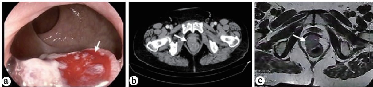
Figure 1. Complementary diagnostic tests. (a) Colonoscopy: ulcerated, hard and friable lesion (arrow), located on the anterior surface of the distal anal-rectum. (b) CT scan: tumor formation (arrow) in the rectum, with no densification of the fat of the ischio-rectal space or lymphadenopathy. (c) Pelvic MRI scan: mass (arrow) in the rectovaginal space of 5.1 × 3.1 cm with origin in the anterior wall of the rectum about 2.9 cm from the anal canal with presumably non-epithelial origin and without apparent local invasion.

This type of tumor originates in interstitial cells of Cajal, located in the myenteric plexus of the gastrointestinal wall, which act as gastrointestinal motility regulators [8]. Approximately 10-30% are clinically malignant; however, all of them have some potential degree of malignancy [9].