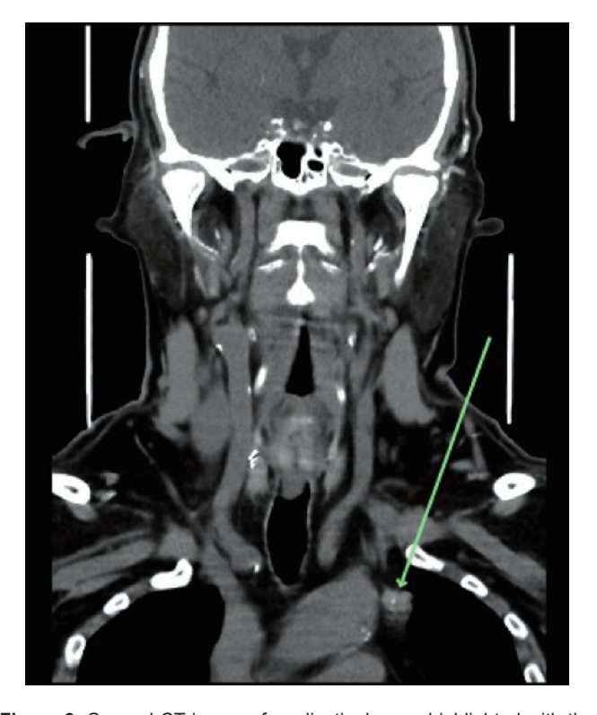
Figure 3. Coronal CT image of mediastinal mass highlighted with the green arrow. CT: computed tomography.

The patient was referred on to a cardiothoracic surgeon and a thoracoscopic excision of the lesion was undertaken in