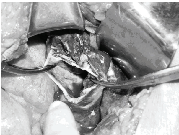
Figure 2. The midline infraumbilical incision with right (R) and left (L) rectus muscles retracted. The peritoneal sac extended downward and sideward extraperitoneally.