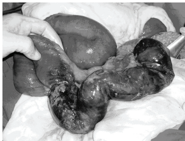
Figure 3. Reduction of incarcerated hernia revealed a 30 cm loop of ischemic and inflamed intestine.

hematocrit 36.4%, leukocyte 11,800/mm 3 , platelets 194,000/mm 3 , Na 135 mEq/L, K 3.8 mEq/L, Cl 102 mEq/L. His liver function tests were normal. We performed an abdominal US, which demonstrated distended intestinal loops in the abdomen, and a mass of edematous intestines located in the lower right iliac fossa. The computed tomography of the abdomen defined distended jejunal loops, and helical torsion of ileal segments located in the rectovesical fossa. The cecum and the rest of colon were normal in size. The characteristic helical torsion of ileum was interpreted as a sign of internal herniation, however its cause remained unclear (Fig. 1).