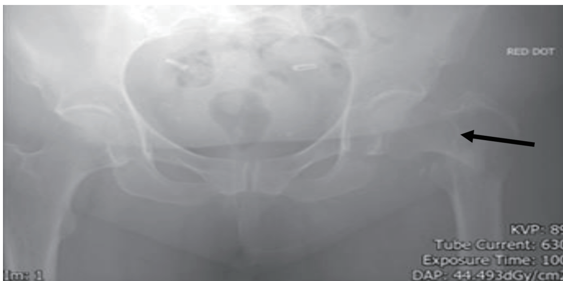
Figure 2. The repeat of pelvic X-ray, 4 days after the X-ray in Figure 1. Arrow points to the site of the fracture of the left neck of the femur.

A subsequent computed tomography (CT) of chest, abdomen, and pelvis (CT CAP) identified a “4-cm solid nodule in the lower pole of the right lobe of the thyroid with retrosternal extension causing tracheal displacement” (Fig. 3). However, her thyroid function was found to be unaffected. An ultrasound scan showed a hypoechoic mass with increased vascularity and a fine-needle aspiration of the thyroid mass was suspicious for non-Hodgkin’s lymphoma (NHL). The patient underwent a CT of her left upper leg to evaluate the size of the femoral