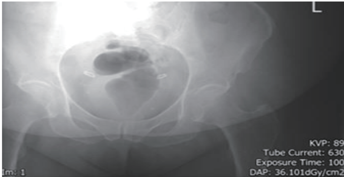
Figure 1. The pelvic X-ray on admission (no clear evidence of fracture of the left neck of the femur).

thyroid function. The thyroglobulin was high (47.55 \mu\text{g/L} ), while dual-energy X-ray absorptiometry (DEXA) scan was normal.