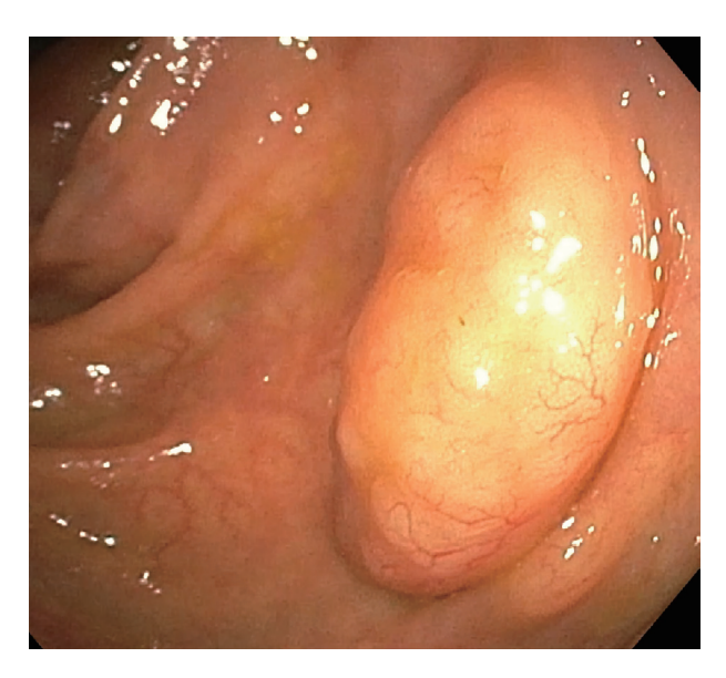
Figure 1. Colonoscopy image of the broad-based polyp in the ascending colon.

negative for CD3, CD5, CD10, and cyclin D1. Immunostaining of the light chains revealed a dominance in the expression of the lambda chains with a 1/10 kappa to lambda chain ratio. Furthermore, the Ki-67 proliferation index was 36%. These findings were compatible with non-Hodgkin B-cell marginal zone lymphoma.