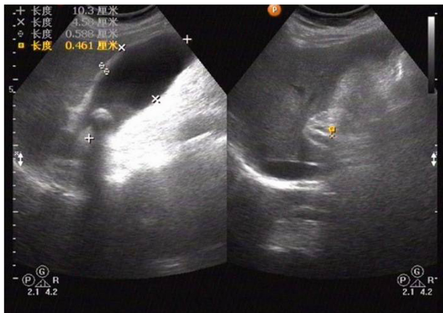
Figure 1. Abdominal ultrasonography shows gallstone and acute cholecystitis: the size of gallbladder is 10.3 cm × 4.6 cm, slightly larger gallbladder with gallbladder wall thickening, and hypoechoic gallbladder.

acute MI 7 days ago especially she had been receiving dual antiplatelet therapy, she had a high risk of MACEs, bleeding and other adverse events during the perioperative period of cholecystectomy. Besides she received bowel resection 30 years ago, open cholecystectomy would be necessary. An emergency open cholecystectomy was performed that day with no blood transfusion. The pathological conclusion was acute hemorrhagic and necrosis cholecystitis and inflammation of gallbladder surrounding tissues (Fig. 2).