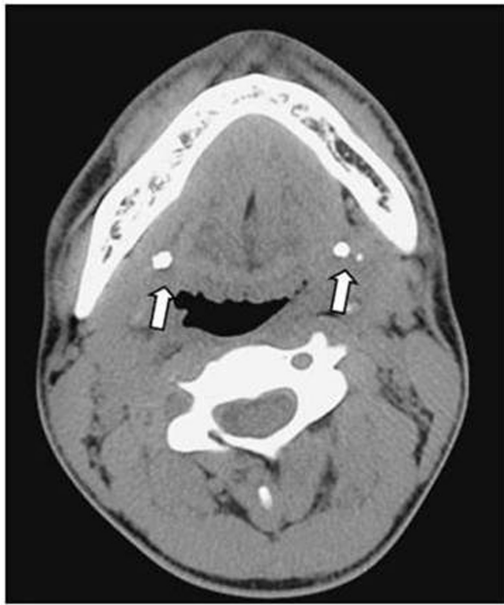
Figure 1. Axial computed tomography scans demonstrating bilateral calcified densities in the submandibular gland (arrows).

field. The stone was removed through the stone size incision made on the upper area of the Wharton's duct where the stone was palpated (Fig. 2). Afterward, the occlusion of the incised salivary duct as the original shape was performed, and the contralateral stone was removed by the same method (Fig. 3). Then, there was no complication and the patient is under the follow-up observation at our outpatient clinic now.