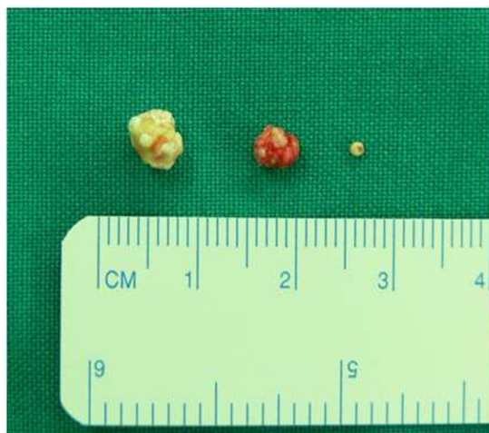
Figure 3. Two stones smaller than 1cm in the hilum of both submandibular gland, and tiny one stone in the parenchyma of submandibular gland were removed.

caused by tiny stones within the duct or inflammation. The treatment outcome of extracorporeal shock wave lithotripsy for submandibular duct stones that account for 80 - 90% of sialolithiasis has the tendency to be lower than for the parotid stone [4]. Sialendoscopy has advantages that it could diagnose other causatives of the obstruction of Wharton's duct such as stricture, torsion, and polyp and treat them, nonetheless, it has limitations for the cases with large size stones or the cases associated with acute sialoadenitis [5].