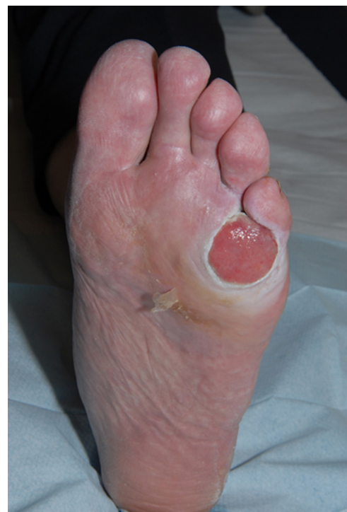
Figure 1. Amelanotic melanoma mimicking neuropathic ulcer.

This 85 year old non diabetic patient presented to our vascular clinic with a six month history of a painless, hypergranulated 5 cm ulcer on the planter aspect of his left foot overlying the 5th metatarsal head (Fig. 1). Initial community based management with antibiotics and regular dressings showed no improvement to the ulceration. Further investigations from clinic showed no evidence of infection or underlying osteomyelitis raising the clinical suspicion of an amelanotic melanoma. Punch biopsy of the lesion revealed malignant melanoma with Computerised Tomography (CT) staging