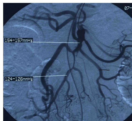
Figure 1. First visceral angiography. Stenosis of the supramesenteric artery with obvious pressure discrepancy was seen.

A 59-year-old male noticed abdominal pain suddenly after hinge drinking in March, 2005. He had taken antihypertensive agents for 10 years. When he visited to our hospital (Teikyo University Hospital, Tokyo, Japan), the vital signs, the abdominal x-ray and electrocardiogram did not show any abnormal finding. The laboratory data demonstrated slight abnormality in coagulation test. Since the symptom continued, he underwent computed tomography indicating isolated dissection of SMA. Visceral angiography demonstrated dissection and stenosis with apparent pressure discrepancy between proximal and distal portion of SMA, without ischemic change (Fig. 1). Surgical or radiological intervention was considered, but the patient chose conservative treatment with oral prescription of low-dose aspirin 100 mg/day and antihypertensive medicines. The abdominal symptom disappeared soon and did not appear again even after initiating oral intake, so he was discharged. The patient began to feel postprandial abdominal discomfort 7 months later. Visceral angiography was performed again, which showed significant