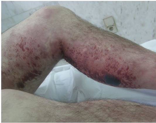
Figure 1. Body decomposition. Picture from the patient's leg taken 12 hrs after his death. It shows the advanced state of body decomposition with gaseous destruction of tissues and formation of haemorrhagic blisters, suggesting the presence of gas-producing bacteria.