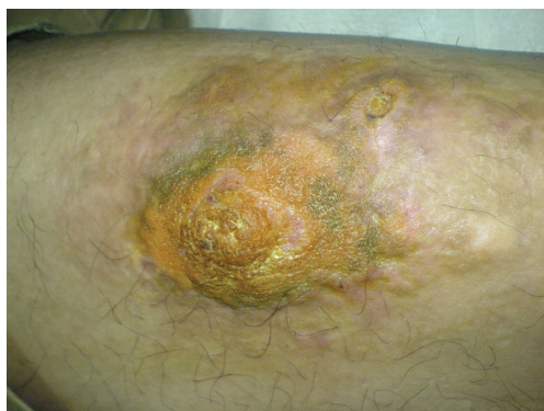
Figure 1. A well-defined, flavostaceous-color, 5 × 5 cm sized, massy plaque covered with some nodules and crusts without hemorrhage present on the shin of left leg.

(Fig.2a). At higher magnification, many physaliphorous cells, located on the upper-mid-dermis were detected and neither malignancy nor cytological atypia were observed (Fig.2b). The histopathology was typical for VV.