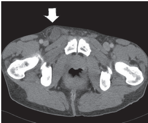
Figure 1. CT scan showing an incarcerated right femoral hernia.