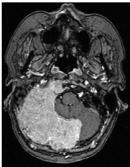
Figure 1. MRI Head with Gadolinium: axial section with level at medulla oblongata.

immunoglobulin levels, serum free light chain assay and full skeletal survey), MRI pelvis/spine and a bone marrow biopsy. There must be no other lytic skeletal lesions and no bone marrow involvement [3]. A small monoclonal protein can be present in up to 75% of cases and this does not exclude the diagnosis of SPB but can carry prognostic relevance if persistent after treatment [4]. Any anaemia, renal failure or hypercalcaemia that is present must have a cause not related to a possible plasma cell disorder.